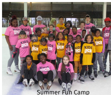
Summer Fun Camp