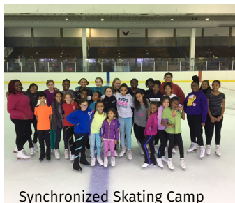
Synchronized Skating Camp