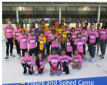
Figure and Speed Camp