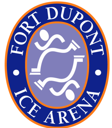
USFS 3RD FIGURE TEST