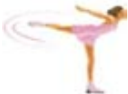
Advanced Figure Skating