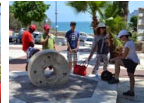
MAKING FRIENDS AND MEMORIES