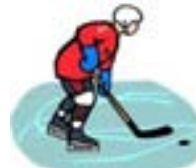
Learn To Play Hockey